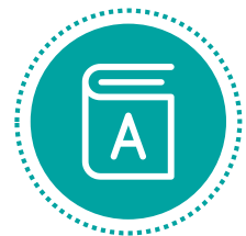
ACCOUNTING & REPORTING SERVICES