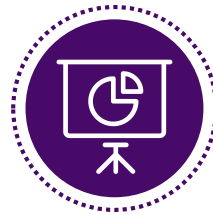
DASHBOARD & DATA VISUALIZATION