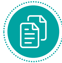
COMPLIANCE (VAT & TAX)