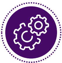
BUSINESS PROCESS AUTOMATION